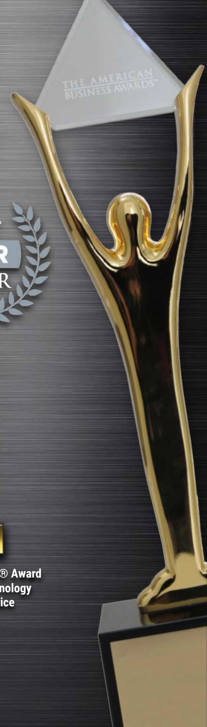
Gold Trophy for Stevie® Award for Best Use of Technology in Customer Service