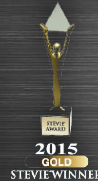
Gold Trophy for 2015 Stevie® Award for Best Use of Technology in Customer Service