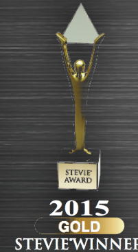
Gold Trophy for 2015 Stevie® Award for Best Use of Technology in Customer Service